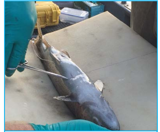
Biologists carefully implant a radio transmitter before releasing the fish back into the river.

BC Hydro is tagging various species of fish, including bull trout, Arctic grayling, rainbow trout, walleye and burbot. More than 1000 fish have been tagged and released in the locations shown below.