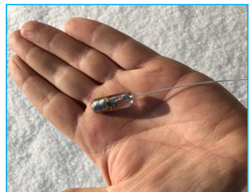
Radio transmitters have a flexible wire antenna that hangs from the fish's body cavity and is visible to anglers.