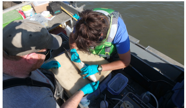
Biologists implant a radio transmitter before releasing the fish back into the river.

Anglers are required to follow provincial fishing regulations. BC Hydro encourages anglers to release radio-tagged fish back into the river with minimal stress.