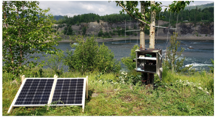
One of 30 new fixed telemetry stations placed on the river bank, which logs data when radio-tagged fish swim by.

Fish are caught, carefully implanted with a harmless radio transmitting device, and released safely back into the river. Radio-tagged fish are detected as they swim by fixed telemetry stations strategically placed along the banks of the Peace River and its tributaries. Each station consists of a radio receiver, radio antennas that point at the river, deep cycle batteries and solar panels to remotely power the electronics, and a cell modem to remotely monitor the performance of equipment. Stations are visited every few weeks to download the logged data, and inspect the test equipment.