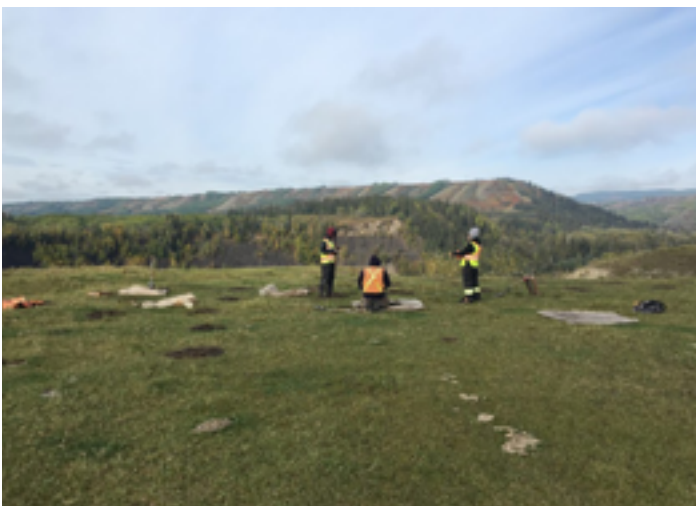
Archaeologists take part in field studies.

Our contractors are aware of any recorded heritage sites in their work areas. However, if they discover an unrecorded heritage site during construction, they must stop work immediately and implement the chance find procedure. Archaeologists will then examine the site and recover any artifacts for further study. Work can only resume once the site has been studied and any artifacts removed.