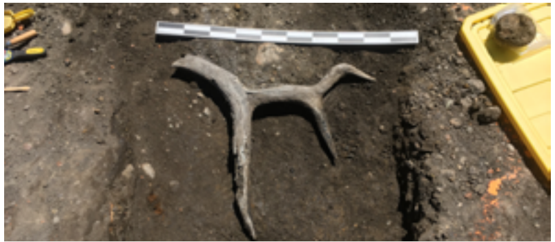
Palaeontological find of a fossilized antler (possibly elk).