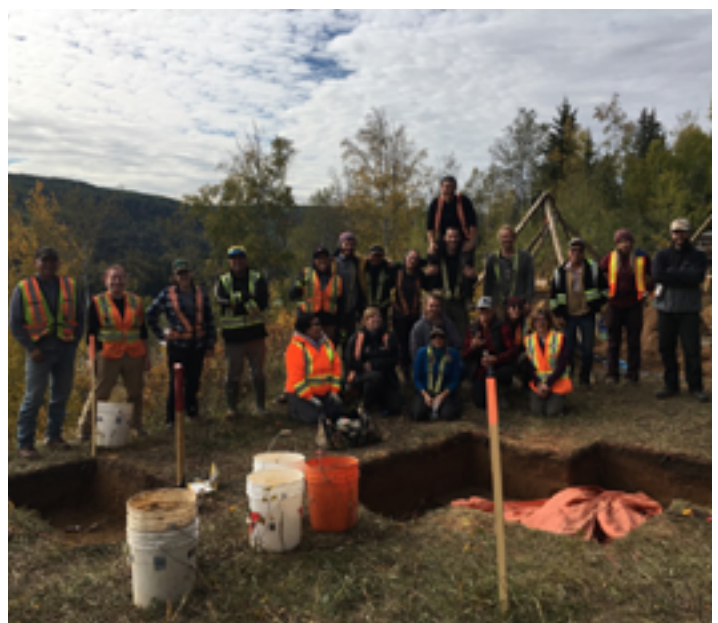
An archaeological crew on site for systematic data recovery fieldwork.