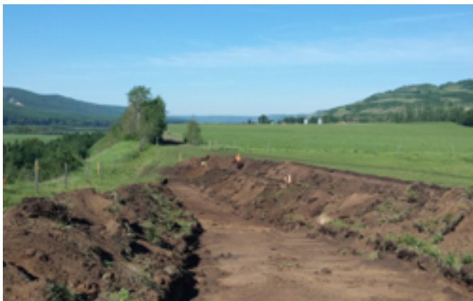
Archaeologists conduct post-ground disturbance inspections.

For archaeological sites that we cannot avoid, the project team conducts a post-ground disturbance inspection. During the inspections we remove the upper layer of soil using machinery, exposing the depths where artifacts are located. This gives us an opportunity to conduct another assessment of the area.