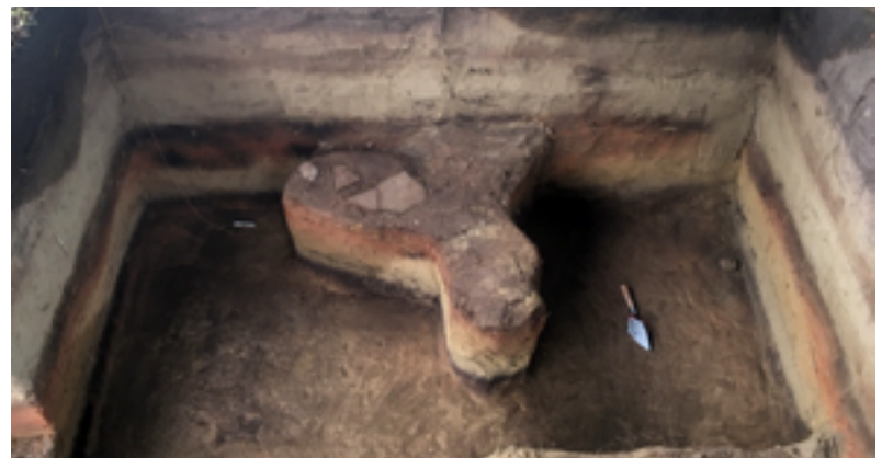
Systematic data recovery fieldwork in progress. The unexcavated portion in the center of the excavation unit is the remains of a hearth or fire pit.