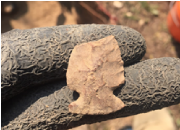
Red Chert projectile point.

Site C's heritage studies have unearthed hundreds of thousands of artifacts. The archaeological artifacts will be stored at the Fort St. John North Peace Museum.