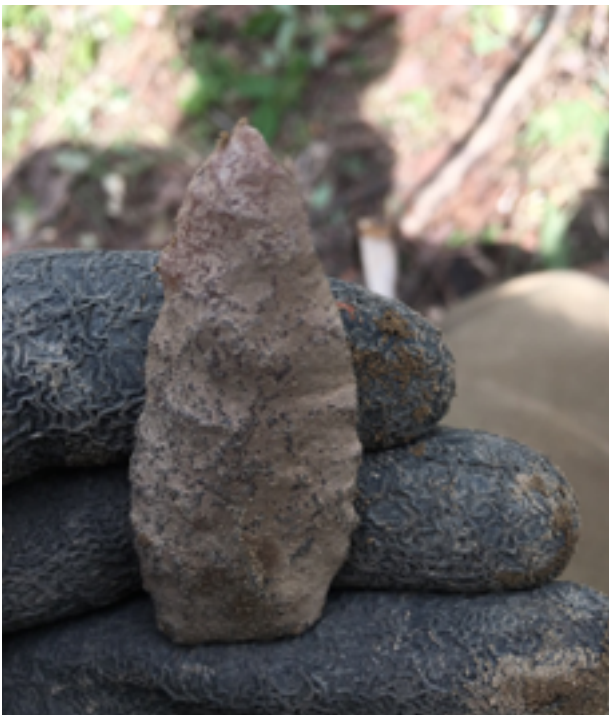
Quartzite projectile point.