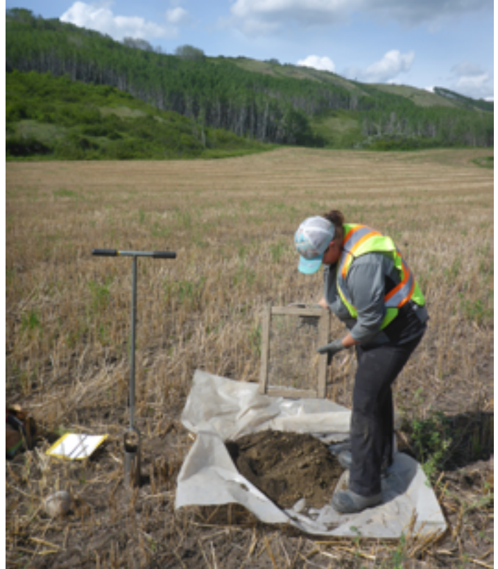
A project archaeologist completes an auger test during archaeological impact assessment fieldwork.