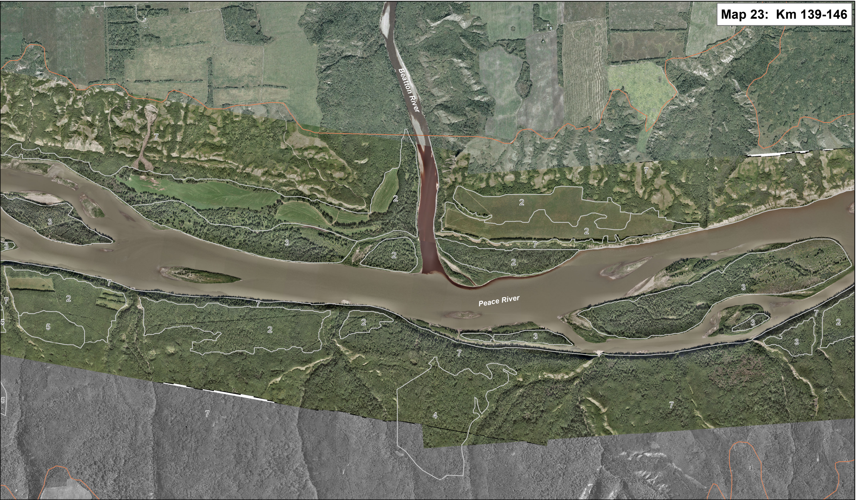
Map 23: Km 139-146