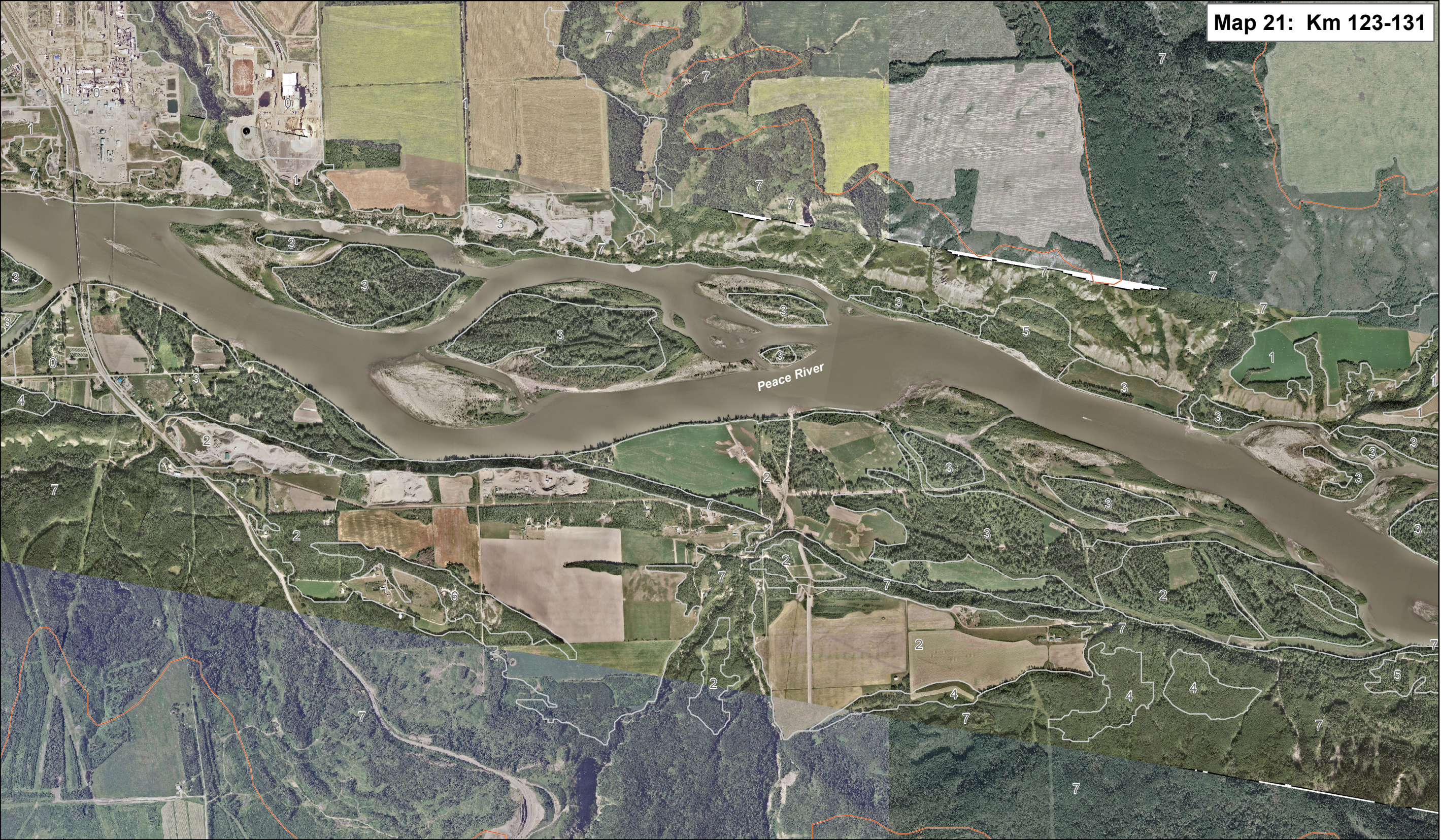
Map 21: Km 123-131