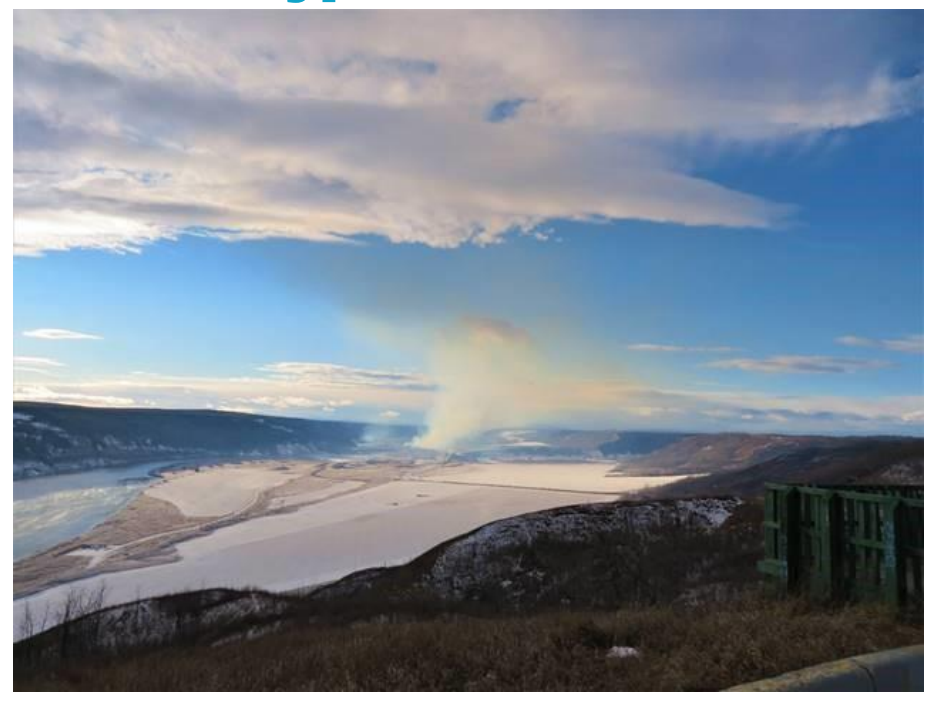
December 10, 2021, at 1:16pm