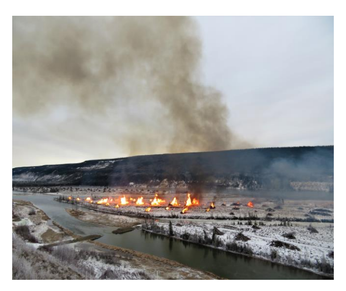
December 10, 2021, at 11:25am

Waste wood piles will be burned in a way that minimizes smoke exposure and risk to communities.