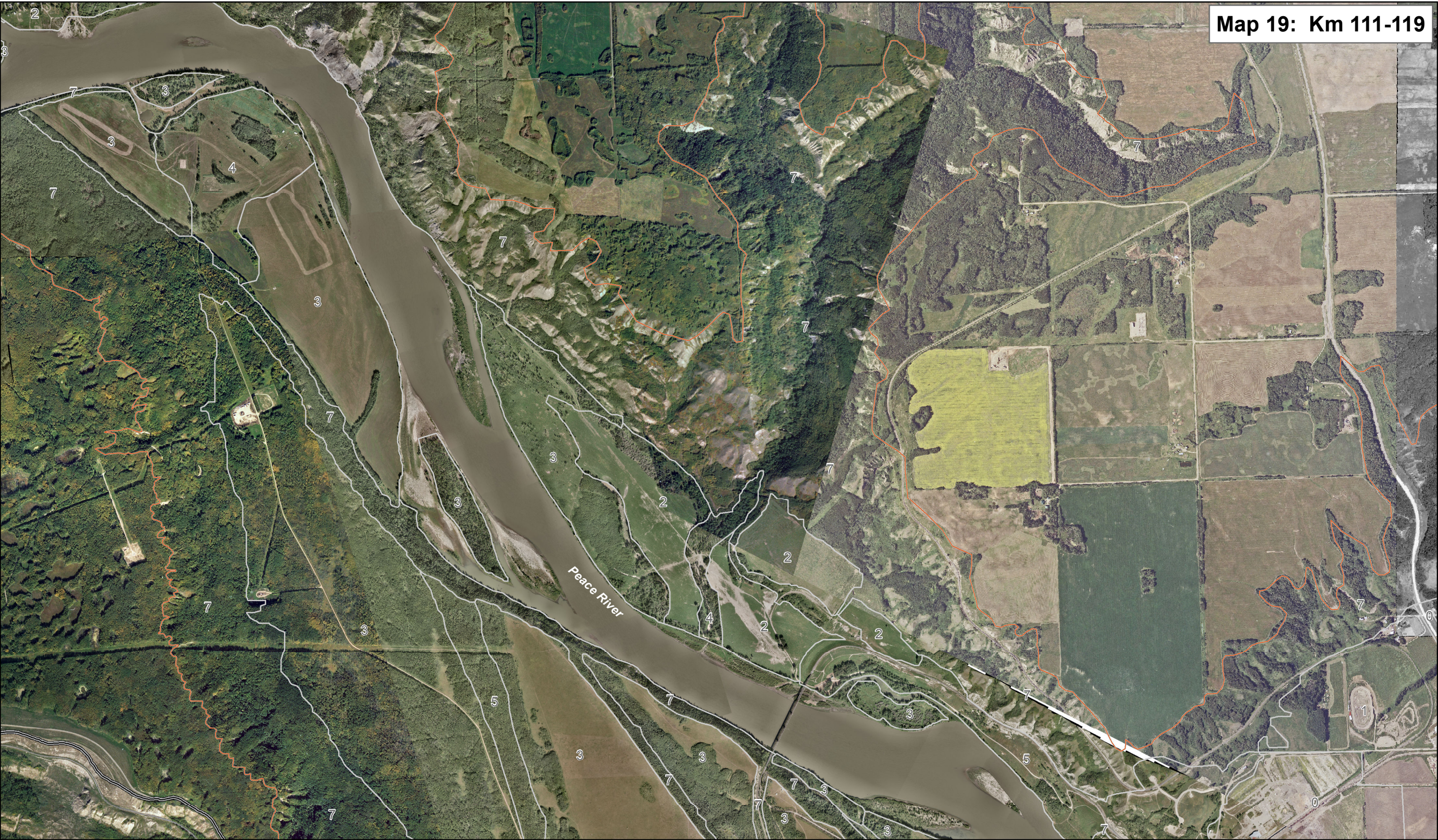
Map 19: Km 111-119