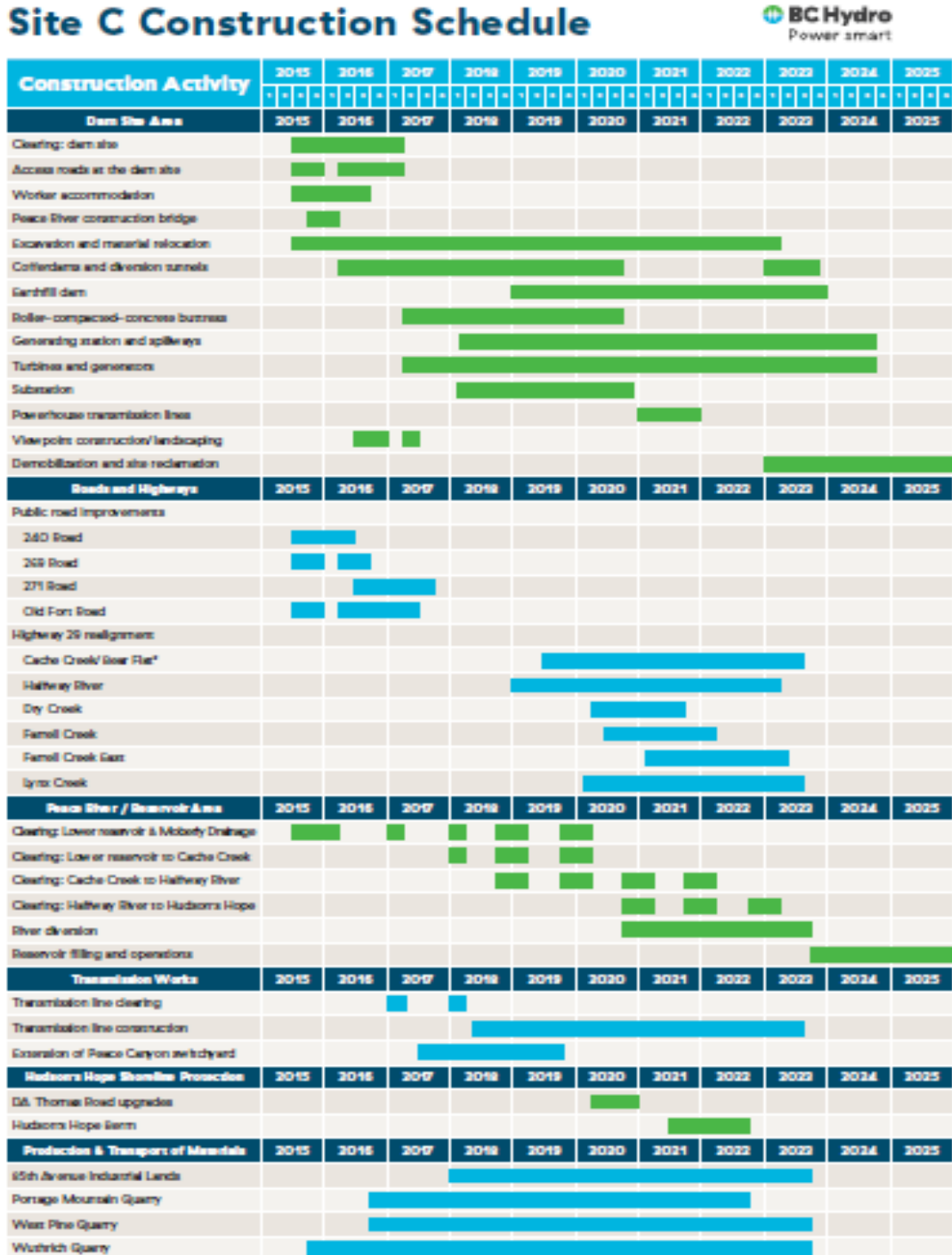
Table F-1 Site C Construction Schedule