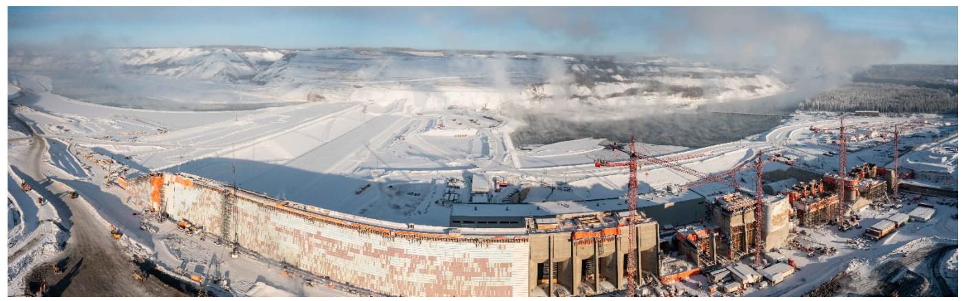
A north-facing panorama shows the dam core buttress, intakes and spillway structures overlooking the dam core trench. See more project photos in the <u>image gallery</u>.